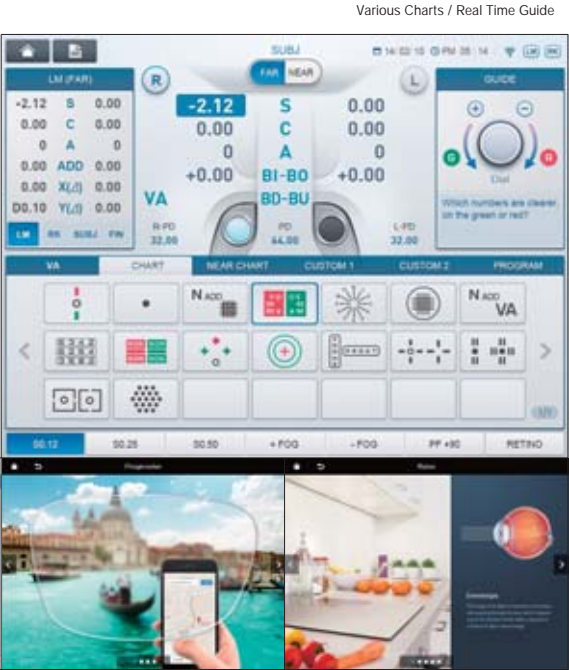
Displaying the Result in Tables and Graphics

Exam can be carried out with not only basic OP panel, but also Tablet and PC for examiners' preferences. (Tablet PC OS : Win 7 or 8 / Resolution 1366x768)