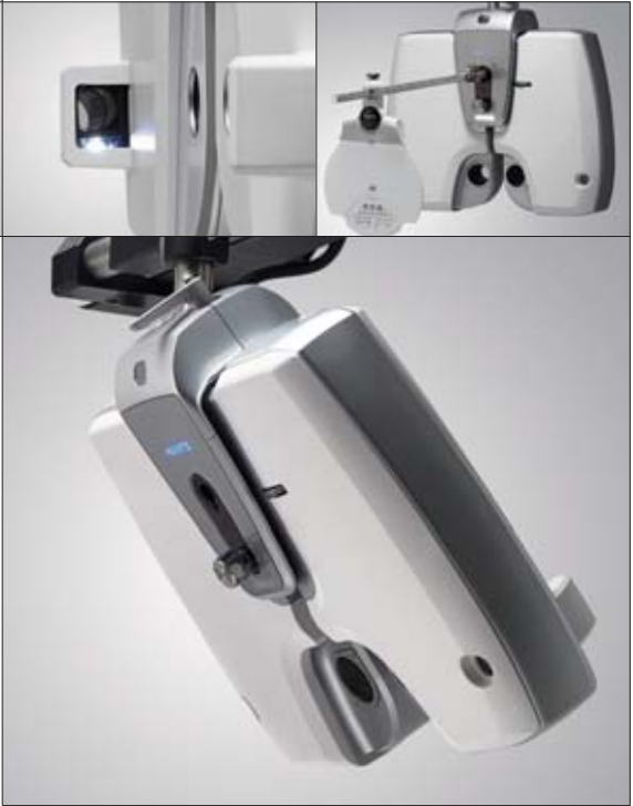
Tiltable Refractor Body