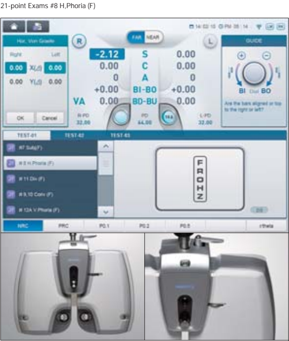
PD Adjustment Automatic Convergence Function

Tiltable Body Highly advanced near vision exam is enabled with tiltable body from 0° to 45° delivering feeling of reading a book.