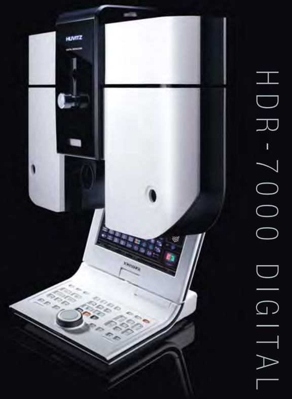
HDR-7000 DIGITAL REFRACTOR

Satisfaction, confidence and comfort- HDR-7000 realizes advanced refraction test with cutting-edge digital technology. Fulfill more precise exam with various vision tests covering basic to more sophisticated ones. Luxurious design and intuitive graphic interface meet the highest requirement of aesthetic and functional comfort.