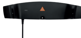
CW1 wall charger [05]